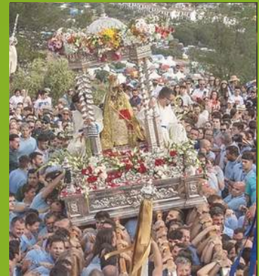
Virgen de la Cabeza

Historic center declared of cultural interest