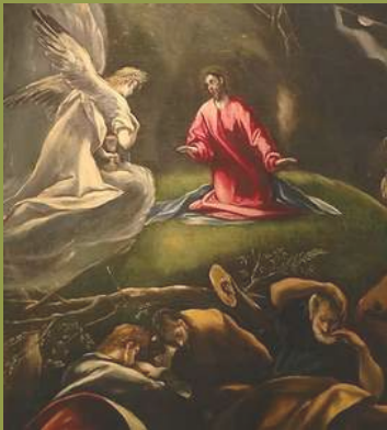
La Oración del Huerto El Greco